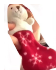
Here is a picture of the toy.

The toy is of huge sentimental value to the toy's owner and the family would be very grateful to learn if anyone has seen it. If found, then please bring the toy to the school office.