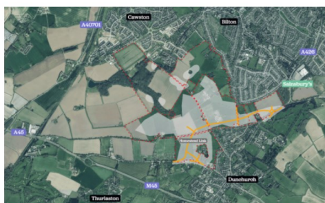
Image: Grey shading highlights areas of Homestead View that are to be included in site investigations.

There has been an update to dates in which Arcadis will be carrying out site investigations at the Homestead View Development.