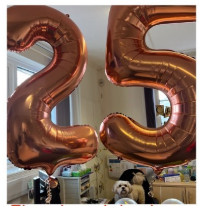
Time to celebrate