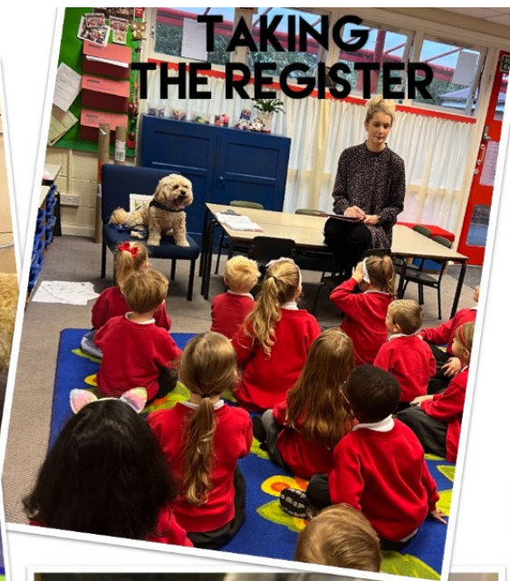
TAKING THE REGISTER