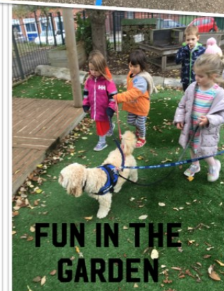
FUN IN THE GARDEN