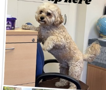
I'm sure there's a treat up here