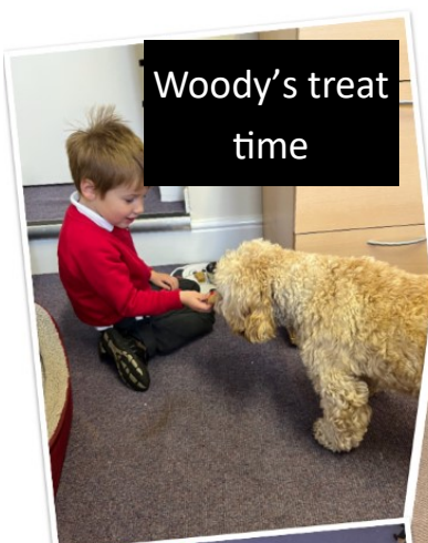
Woody's treat time