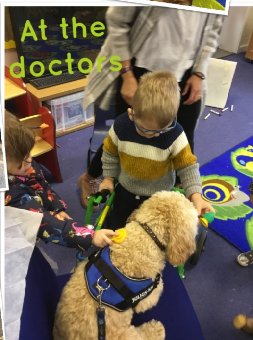
At the doctors