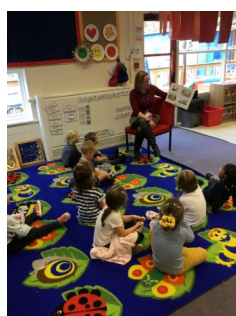
Some photos of our lovely nursery children and staff