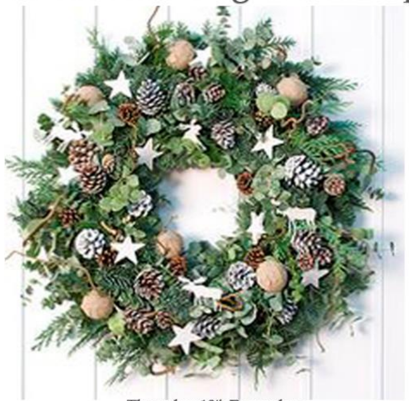
Thursday 12<sup>th</sup> December 6pm-9pm Leamington Hastings C of E School

Come and make a traditional wreath. Material and decorations supplied. Mulled wine and nibbles provided