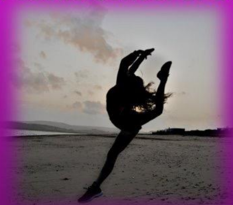
SCSD Dancer

Ballet, Tap & Disco/Street Dance Classes for children & Teenagers (Pre-school Ballet from age 2)